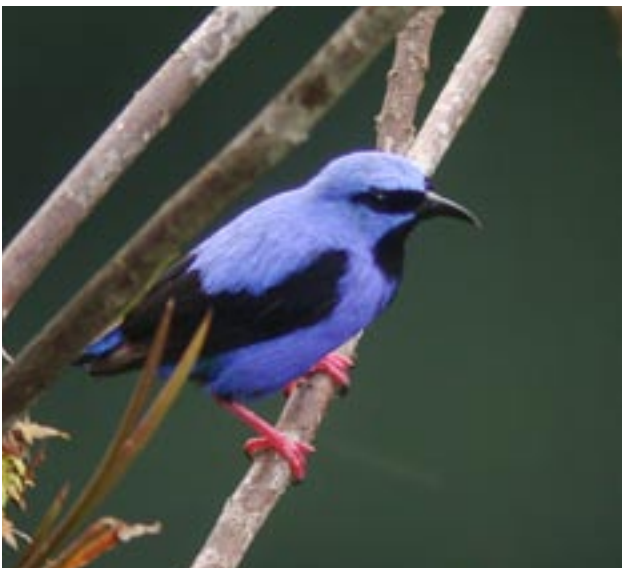
Male Short-billed Honeycreeper