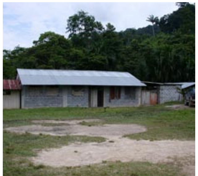
The Biological Station at San Jose