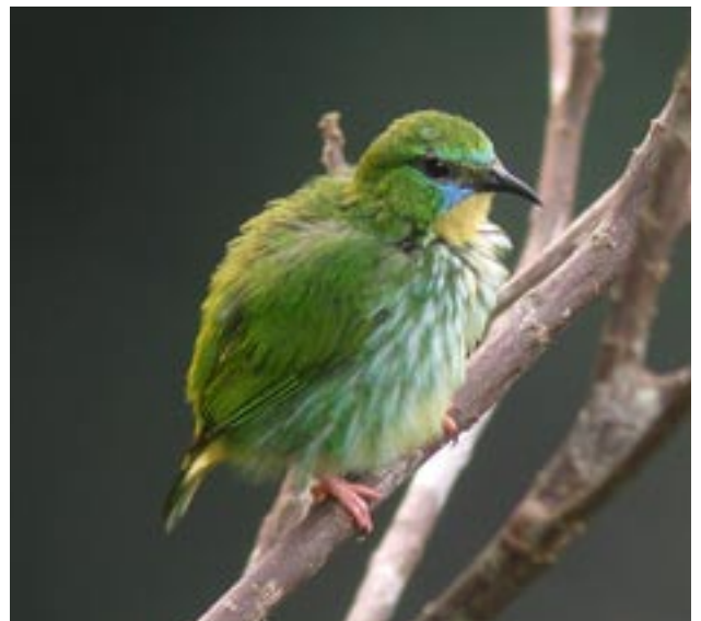
Female Short-billed Honeycreeper