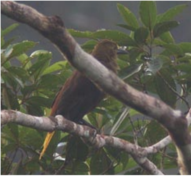
Russet-backed Oropendola of the dark-billed ssp angustifrons .