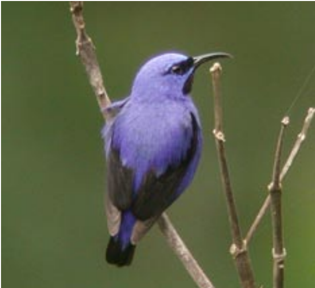
Male Purple Honeycreeper