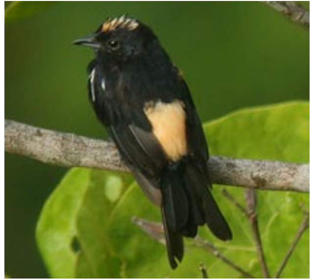
Male Fulvous-crested Tanager